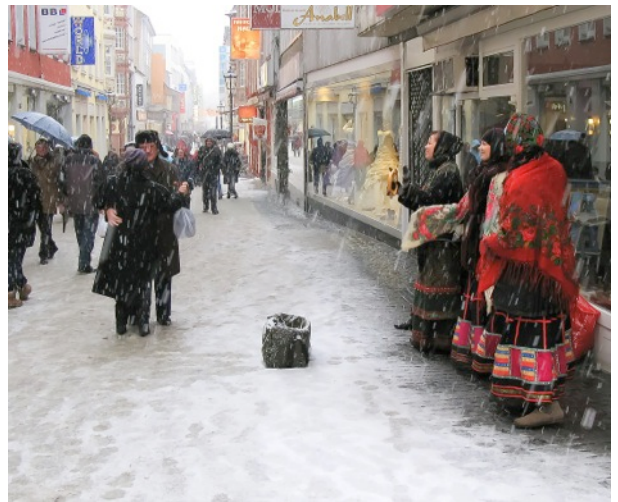
Color Print by Charles Leverett